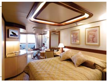
approx. 367 square feet

Single seating dining in the Princess Grill, access to the private Grills lounge, 24-hour room service. Two beds that convert to a queen, fine linens and duvet, pillow concierge menu, Shoe shine service, fine soaps and shampoos.