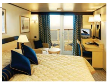
approx. 248 square feet as pictured (AC)

24-hour room service. two beds that convert to a queen, refrigerator, safe, hair dryer, bathrobe & slippers, nightly turn-down service, satellite TV, Bon Voyage half bottle of sparkling wine upon embarkation, and more.